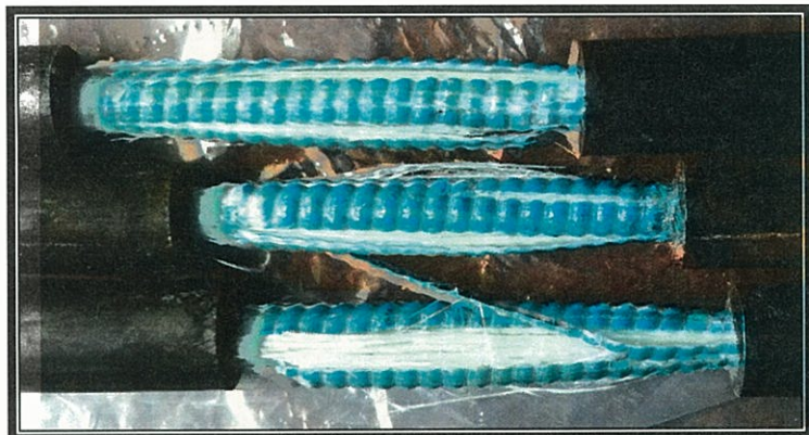
Photograph 2 : Show tested samples