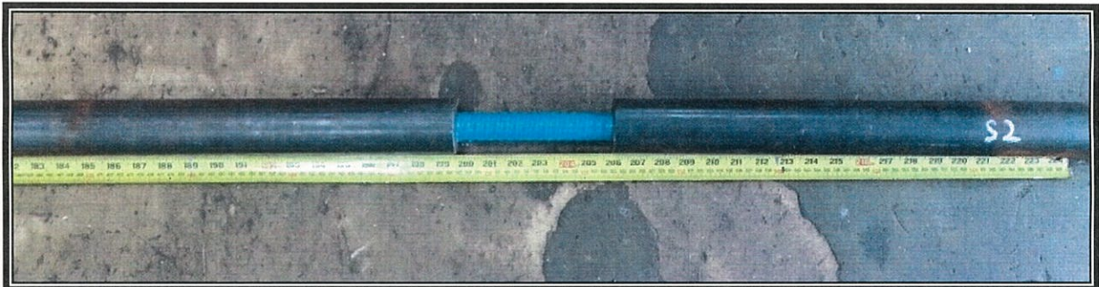
Photograph 1 : Show sample submitted