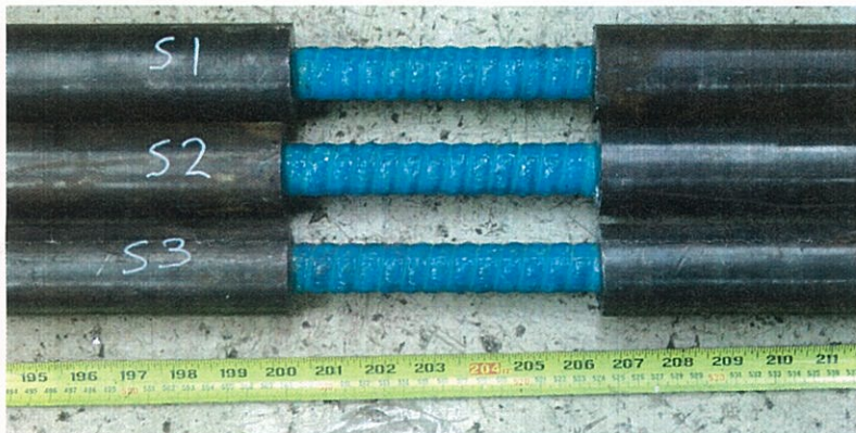
Photograph 1 : Show sample submitted